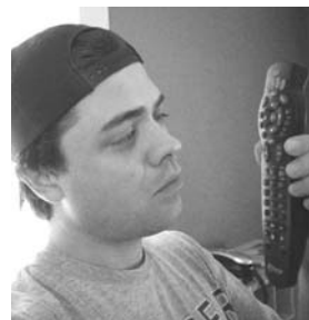
Why does my remote have so many buttons?