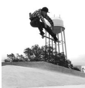
Bankhead demonstrates the wonder of Velcro